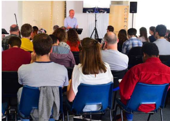
Globe Church London