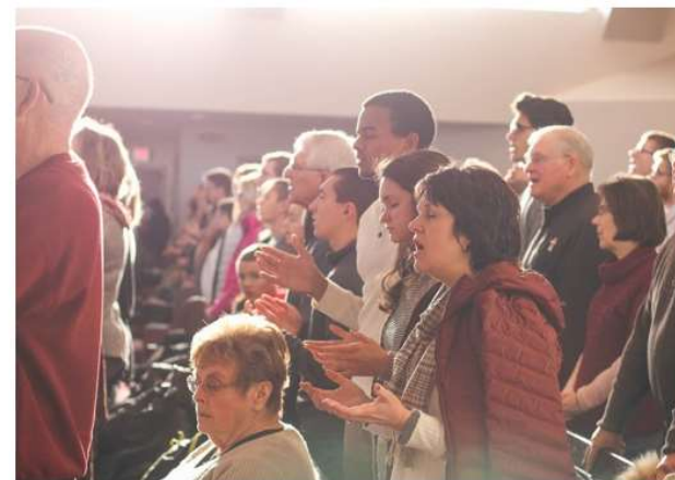
Trinity Church Oxford