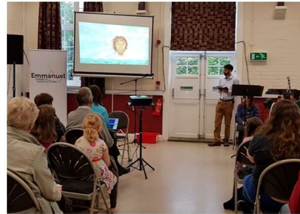
Emmanuel Church Northstowe