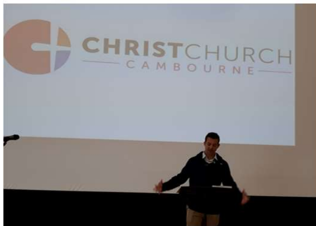
Christ Church Cambourne